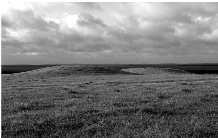
Figure 4. Prehistoric mounds ( cerritos de indios ) at the hills of Potrero Grande in Rocha Department.

It would require another article to examine how local communities reinterpreted monuments as part of their life, but one relevant consequence of this multi-vocal practice we would like to mention here is that the cerritos (prominent and conspicuous sites within their surroundings) were reintroduced as places and territorial markers in the mental maps of local populations. This was particularly