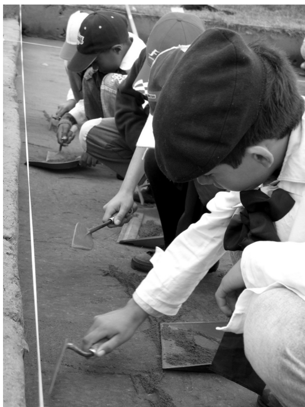
Figure 6. Children from a rural school of Pago Lindo, excavating an archaeological mound site in Caraguatá river locality.

possible to create structure, to facilitate heritage management and research and to strengthen the capacities of all of those involved (research groups, the community, authorities, etc.). Being optimistic, we predict that our work will contribute towards defining, in the near future, a convergent strategy for the construction of a heritage policy in Uruguay. At the same time, our work has made it possible to generate constant scientific innovation and renewal, to construct common conceptual frameworks, to develop and apply formal methodologies for analysis, diagnosis and intervention, to train local agents in sustainable heritage management, and to think about community-based work to promote participative heritage processes which mirror the cultural diversity of our societies. Finally, this cooperation model means that we help Uruguay as much as Uruguayan experience has changed many Spanish practices. Moreover, the local population has learned as much about its lost knowledge (such as traditions, sites and place names) as we – the archaeologists – have learned about our fields of interest.