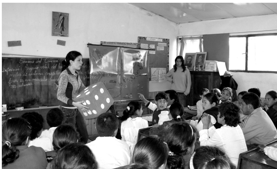
Figure 5. Scholars playing the game The River of Time about the prehistory and history of Uruguay in a rural school of Caraguatá.

remarkable amongst children, who completely missed any knowledge about the landscape of their own family traditions.