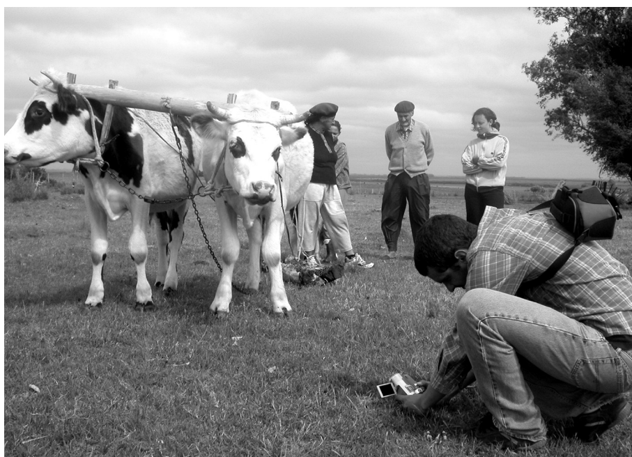
Figure 2. Moment of ethnographic fieldwork and film documentation in Pueblo de Arriba, Tacuarembó (Photo: LAPPU/Incipit).

As said, the co-evolution of Incipit and the archaeological teams from the UdelaR finally led to the creation of the LAPPU in the fourth stage of our relationship. This ambitious project was made possible with substantial funding from a call by AECID to support scientific cooperation for development. This inter-university cooperation programme, as it was called, had four main categories. We designed a collaborative project in category four, allocated to promote the transfer of